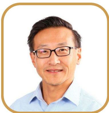
Joe Tsai Chairman, Alibaba Group

She is also a multiple award-winning entrepreneur and the First Nigerian recipient of the prestigious International Women Entrepreneurial Challenge Award (IWECA) as a nominee of the US Department of State in 2008.